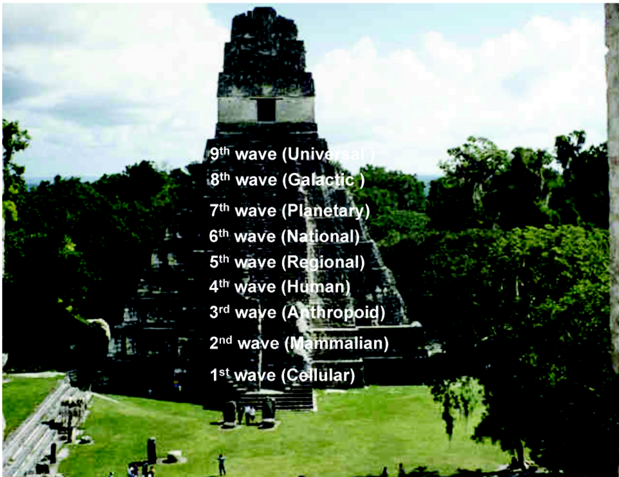
Fig 1. The Cosmic Pyramid, or the nine-step-god (Bolon Yookte), whose nine waves will simultaneously manifest as the Mayan calendar comes to an end.

of time and continue to happen whenever there is a significant energy shift in the Mayan calendar, such as between any of its DAYS and NIGHTS.